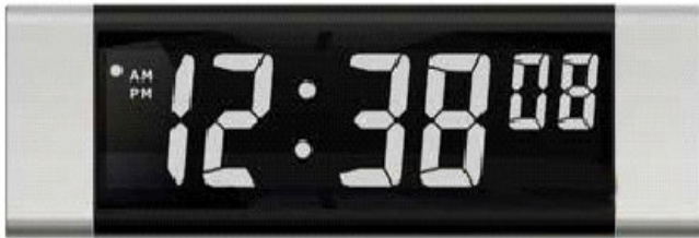
2.5" 6 Digit White LED Timer